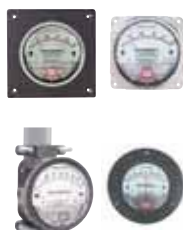
Flush, Surface or Pipe Mounted

Note: May be used with hydrogen. Order a Buna-N diaphragm. Pressures must be less than 35 psi.