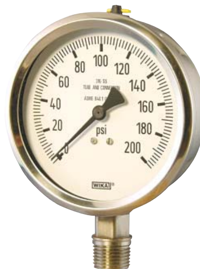
Bourdon Tube Pressure Gauge Model 132.53

Additional error when temperature changes from reference temperature of 68°F (20°C) ±0.4% for every 18°F (10°C) rising or falling. Percentage of span.