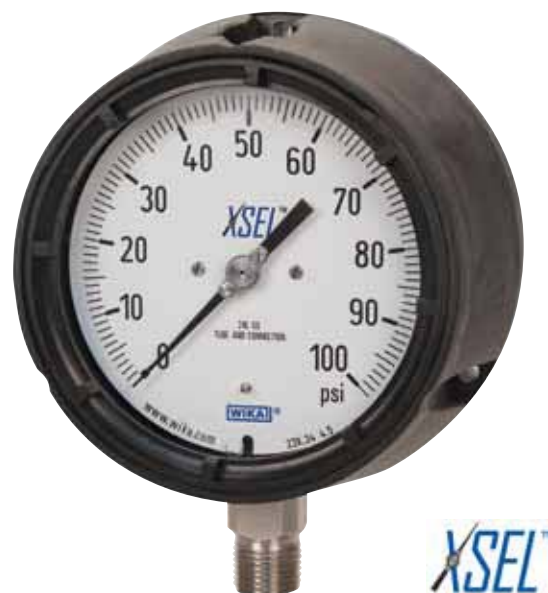
Bourdon Tube Pressure Gauge Model 232.34

Additional error when temperature changes from reference temperature of 68°F (20°C) ±0.4% for every 18°F (10°C) rising or falling. Percentage of span.