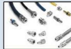
Hoses and Connectors