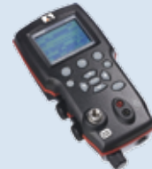
Hand Held Pressure Calibrators