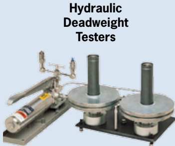
Hydraulic Deadweight Testers