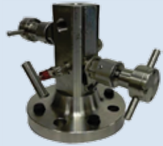
Compact Primary Isolation & Root Valves