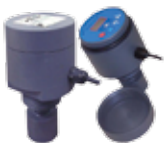
LEVEL SWITCHES & TRANSMITTERS Float - Head Pressure Ultrasonic - Capacitance Conductance - Pump Control

"Engineered Level Instruments" for solving each application with the best available technology.