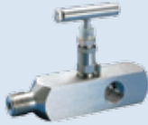
Multi-Port Block & Bleed Double Block & Bleed