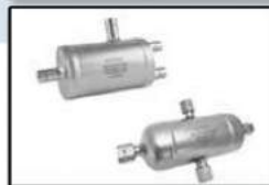
Condensate Pots and Vessels