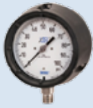
XSEL® Process Gauge 5/10 Year Warranty

World's largest manufacturer of pressure & temperature instruments.