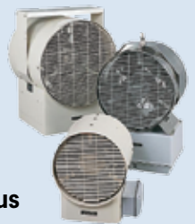
Blowers Convection Heaters General Purpose - Hazardous Heavy Duty - Portable