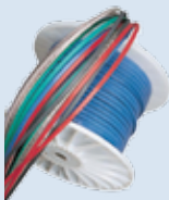
Heat Trace Cable Thermostats & Controls

Heating Cable & Controls - Comfort Heaters