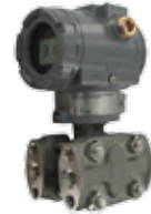
Wide Adjustable Deadbands