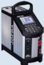
Dry Block Temperature Calibrators

World's leading developer of calibration instruments for temperature, pressure and process signals.