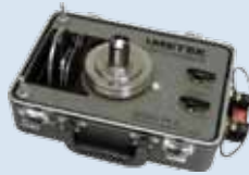
Pneumatic Deadweight Testers