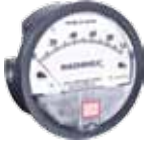
Low Pressure Differential Pressure Gauges & Switches