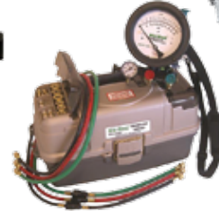
Backflow Test Kits