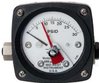
Model 120 0-30 PSID With Maximum Follower Pointer