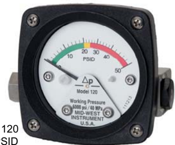
Model 120 0-50 PSID With Special 3 Color Dial

An optional maximum indication follower pointer provides automatic indication of maximum differential occurring during a time period or system cycle. Reversed pressure ports are optionally available to facilitate installation and readability depending on which side of a filter, etc., the instrument must be installed.