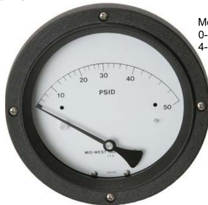
Model 120 0-50 PSID 4-1/2" Dial