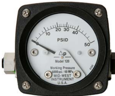
Model 120 0-50 PSID 2-1/2" Dial

A low cost differential pressure gauge for use in measuring the pressure drop across filters, strainers, separators, valves, pumps, chillers, etc., and for local flow indication and control.