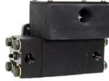
Model 140 shown with “EA” switch option.

(1) Reed switch in general purpose enclosure Division 2 Hazardous locations with 7 position terminal strip. An opening at rear of enclosure accepts ½” flexible weather-proof or conduit connector (supplied by customer).