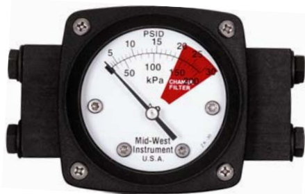
Model 140 0-30 PSID & 0-200 kPa with 2-1/2" Dial & Special Color Dial