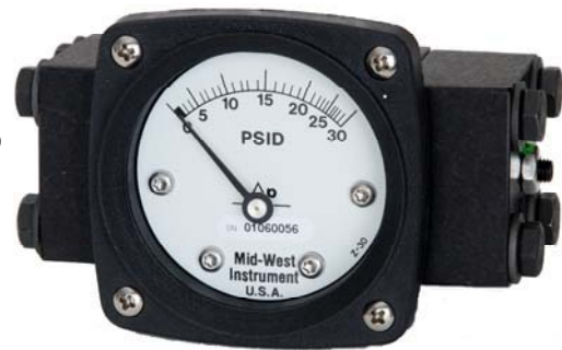
Model 140 0-30 PSID with 2-1/2" Dial

“A World Leader in Differential Pressure Gauges, Switches & Transmitters