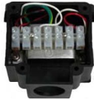
Model 142 shown with “BA” switch option

(2) Reed switches located inside NEMA 4x enclosure with 7 position terminal strip. An opening at rear of enclosure accepts ½” flexible weather-proof or conduit connector (supplied by customer).