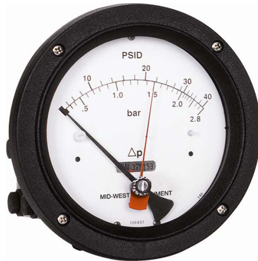
Model 140 0-40 PSID & 0-2.8 Bar with 4-1/2" Dial & maximum follower pointer