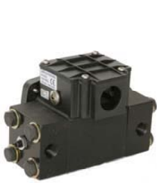
Model 140 shown with “AA” switch option

(1) Reed switch located inside NEMA 4x enclosure with 7 position terminal strip. An opening at rear of enclosure accepts ½” flexible weather-proof or conduit connector (supplied by customer).