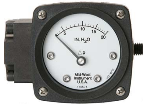
Model 142 0-20" H 2 O with 2-1/2" Dial

Ideally suited for use on dissimilar fluids and wet gas or fluids with a high concentration of solids, etc.