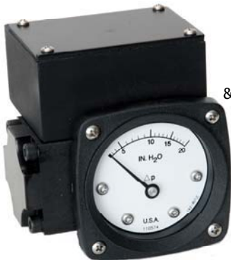
Model 142 with 2-1/2" Dial & 4-20mA Transmitter

“A World Leader in Differential Pressure Gauges, Switches & Transmitters