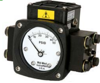
Model 142 shown with “BA” switch option

(2) Reed switches located inside NEMA 4x enclosure with 7 position terminal strip. An opening at rear of enclosure accepts ½” flexible weather-proof or conduit connector (supplied by customer).