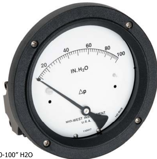
Model 142 0-100" H 2 O with 4-1/2" Dial