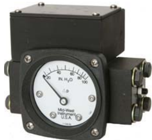
Model 140 shown with “EA” switch option.

(1) Reed switch in general purpose enclosure Division 2 Hazardous locations with 7 position terminal strip. An opening at rear of enclosure accepts ½” flexible weather-proof or conduit connector (supplied by customer).