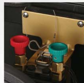
Quick Release Latch Pin