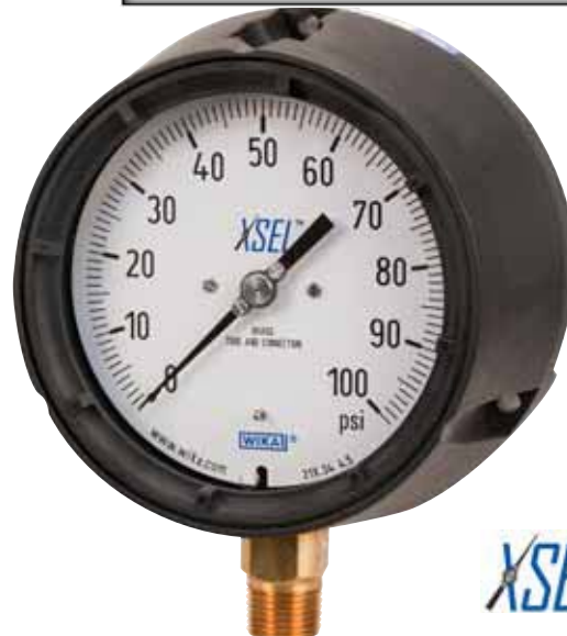
Bourdon Tube Pressure Gauge Model 212.34

Additional error when temperature changes from reference temperature of 68°F (20°C) ±0.4% for every 18°F (10°C) rising or falling. Percentage of span.