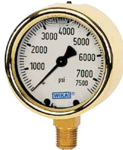
Bourdon Tube Pressure Gauge Model 213.40

Medium: max. +140°F (+60°C) - soldered system max. +212°F (+100°C) - brazed system