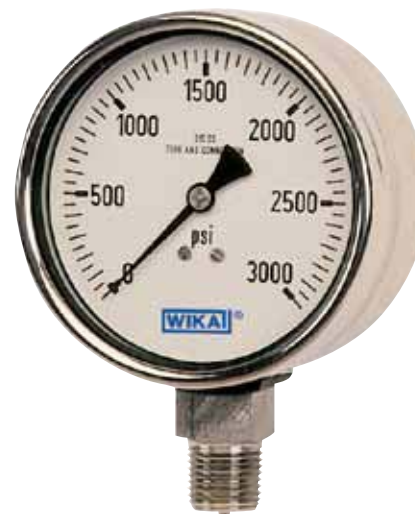
Bourdon Tube Pressure Gauge Model 232.30

Ambient: -40°F to +140°F (-40°C to +60°C) - dry -4°F to +140°F (-20°C to +60°C) - glycerine filled -40°F to +140°F (-40°C to +60°C) - silicone filled Medium: +392°F (+200°C) maximum - dry +212°F (+100°C) maximum - liquid filled