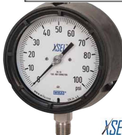
Bourdon Tube Pressure Gauge Model 232.34

Additional error when temperature changes from reference temperature of 68°F (20°C) ±0.4% for every 18°F (10°C) rising or falling. Percentage of span.