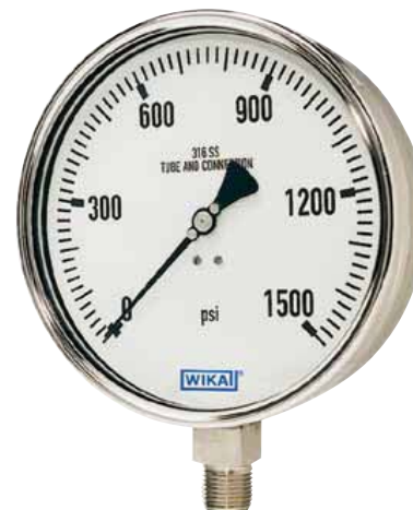
Bourdon Tube Pressure Gauge Model 232.50

Ambient: -40°F to +140°F (-40°C to +60°C) - dry -4°F to +140°F (-20°C to +60°C) - glycerine-filled -40°F to +140°F (-40°C to +60°C) - silicone-filled